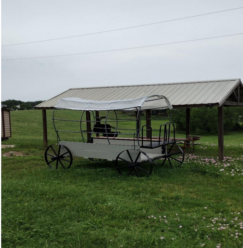
Conestoga Wagon afterwards